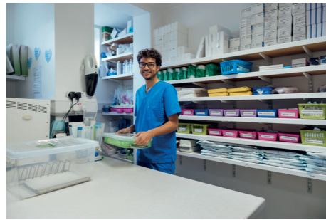
Healthcare Material Management