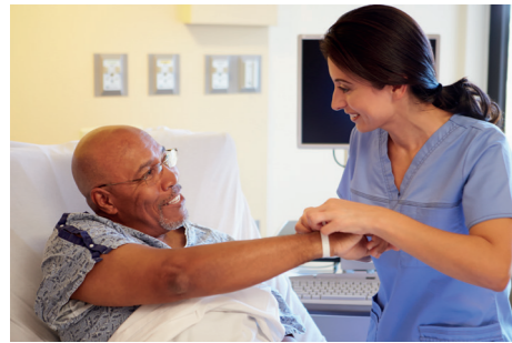
Staff and Patient ID Tracking