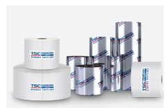
Thermal Printing Solutions