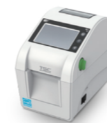
DH 220/320 HTC