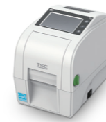
TH 220/320 HTC