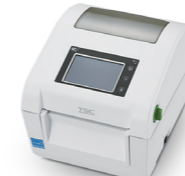
DH 240/340 HTC