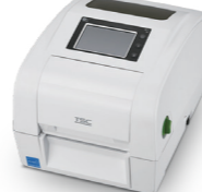
TH 240/340 HTC