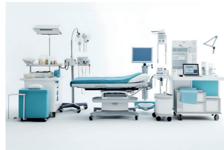
Medical Equipment Labelling

Our many years of experience in all vertical market applications, flexible customised services and the reliability of our products together form the core of TSC Auto ID's competitiveness and success. We do everything it takes to fulfill our brand promise every day with our smart products and excellent customer service.