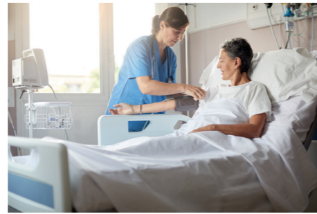
Point of care